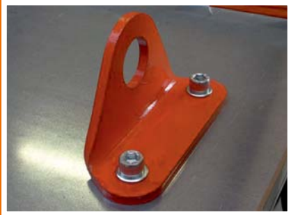
Centralized and balanced lifting eye.