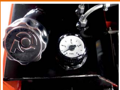
Fuel level gauge.