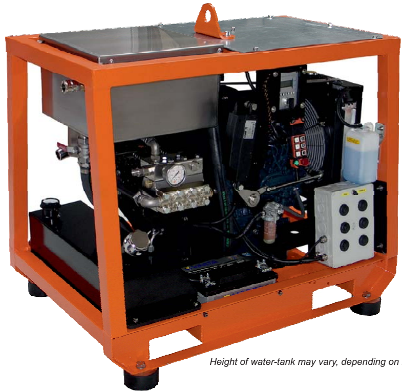
Height of water-tank may vary, depending on model