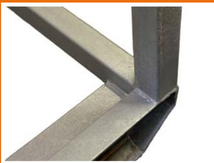
Hot Dip galvanized frame.