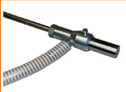
Wet Sand Blasting Equipment.