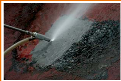
Wet Sand-blasting on Corroded steel plates.